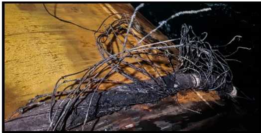
1) DAMAGED SUBMARINE POWER CABLE

Belgium is strongly investing in renewable energy as to reduce its carbon dioxide emissions by 40% starting from 2030. Expanding offshore wind farms as a source of renewable energy will be an important factor in reducing energy-related greenhouse gas emissions. A key vulnerability of offshore energy production facilities are submarine power cables, that can be damaged in all stages of their life. Major causes of subsea power cable failure include poor installation, cable ageing and fishing activities. Damages to offshore power cables make up almost 85% of total project insurance costs. A way to address this challenge is to monitor power cable deformations throughout their entire lifetimes.