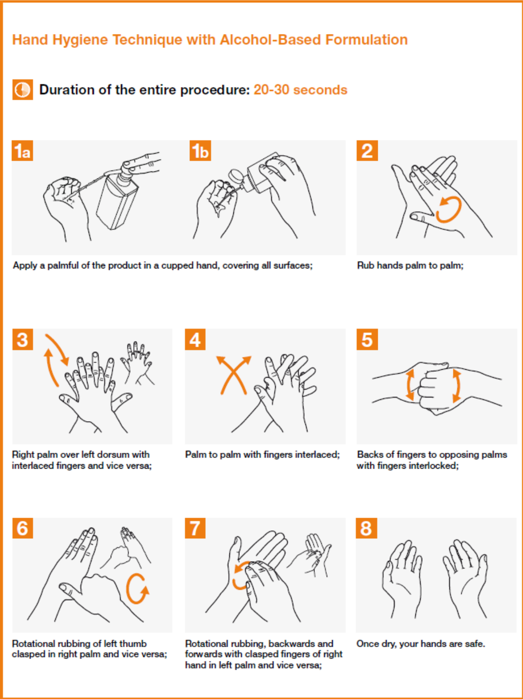
Figure 1: Disinfection of hands with an alcohol-based solution